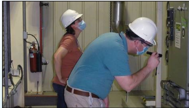
Safe and secure use of Radioactive Materials