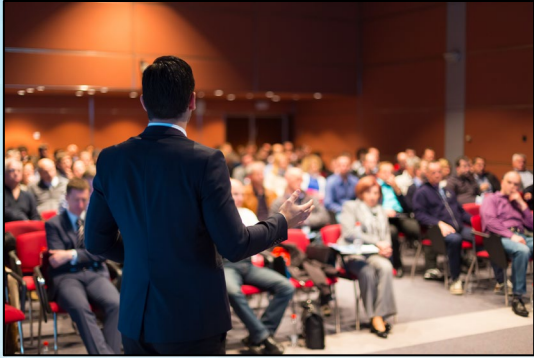
Inspiring stakeholder confidence in the NRC