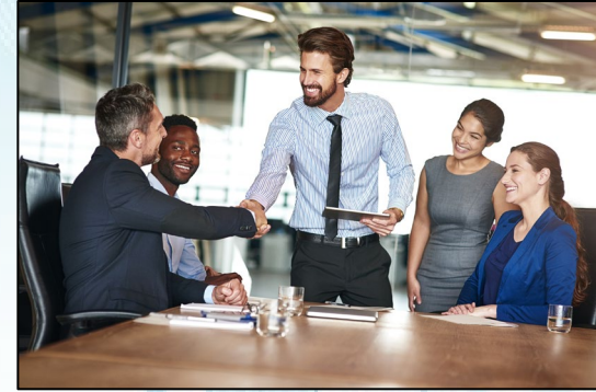
Continuing to foster a healthy organization